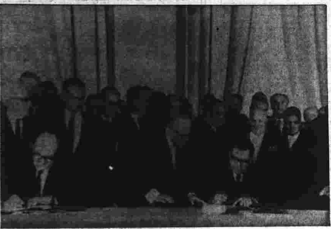
American and Russian foreign ministers sign the limited nuclear test ban treaty in the Kremlin Palace today.